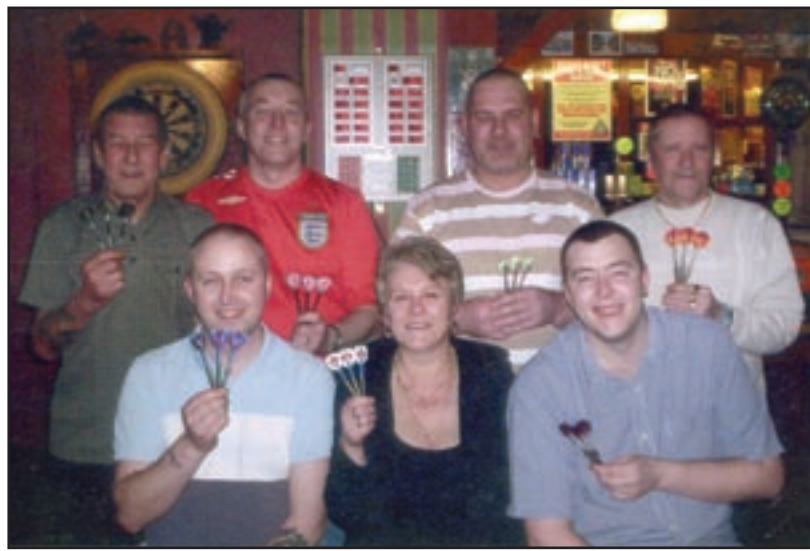
The Oak Tree Darts Team say thanks for the Community Chest grant they used to buy a new scoring machine. (More Community Chest news on page 4)

Six of these will now be playing for outdoor bowls teams during the summer, before resuming in the top indoor bowls division next winter season.