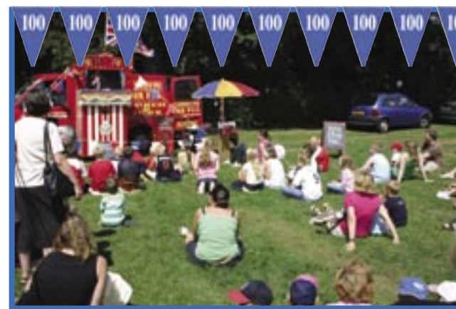
Parents and children relax in the sunshine and enjoy the Punch & Judy show